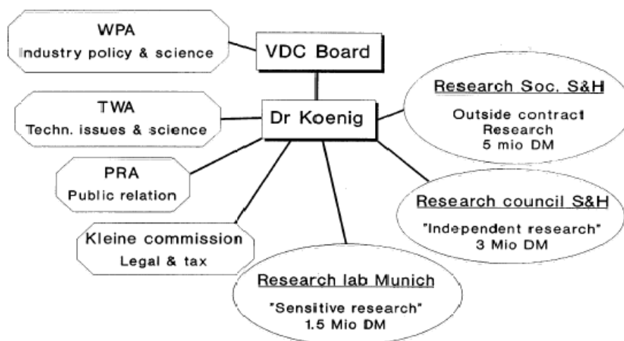
Figure 1: Verband Structure (in 1990). The WPA (Wissenschaftspolitischer Ausschuss, Science and Policy Committee and PRA (PR-Ausschuss, Public Relations Committee) are the two committees dealing with public relations. The TWA (Technisch-Wissenschaftlicher Ausschuss, Technical-Scientific Committee) deals with common technical and scientific problems concerning the cigarette industry. The “Kleine Kommission” deals with legal and tax issues 5

The Research Council Smoking and Health (Forschungsrat Rauchen und Gesundheit), an advisory body to the Scientific Department of the Verband, was founded in 1975 and, similar to its US-equivalent the Scientific Advisory Board of the American CTR, 14 represented an effort by the tobacco manufacturers to indirectly fund research projects recommended by a committee of prestigious scientists favouring the tobacco industry. 15 It was self-serving, paying six of its members 53% of the funds in its first working period (1976-1979) and frequently published its research in (supplements of) a widely read medical journal, the “Klinische Wochenschrift.” 16-18 As was stated at the annual assembly of the Verband in 1983, the Verband thereby secured the cooperation of prominent scientists which would not be affected by the criticism of “anti-smoking circles.” 19