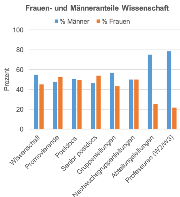
Figure 3: Gender distribution across scientific career levels.