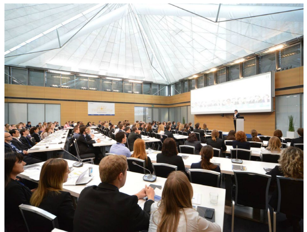
Fresenius Career Day "Meet the Board"