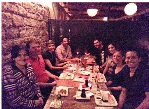
September-Postdoc-Get-Together: Sushi dinner on Monday the 29th of September