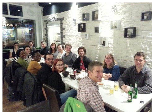
October-Postdoc-Get-Together: Korean dinner on Thursday the 30th of October