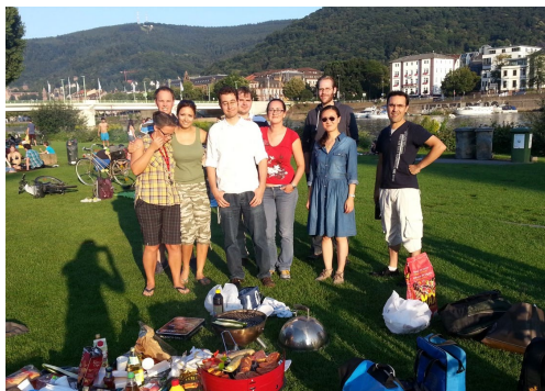
July-Postdoc-Get-Together: BBQ on Thursday the 31st of July

As always, I am trying to organize different activities on different days of the week so that you can join at least once in a while. In June this year, we visited the Handschuhsheimer Kerwe that was a nice occasion to try out a traditional German festival. Then, we could finally-thanks to weather cooperation! - made our long-awaited BBQ take place in July. After a little summer break in August, we got together again in September over a nice