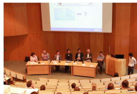
Panel discussion about the future of publishing