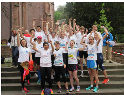
The DKFZ half marathon running team