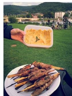
Get-Together at restaurant Vettres and picnic at Neckarwiese

As the weather finally got warmer in May, I spontaneously decided to organize a picnic on the Neckarwiese. Despite the fact that it was quite spontaneous there was a small yet very international group of scientists who turned the little picnic into a professional international BBQ feast. Participants were from Canada, Scotland, Macedonia, Italy and Spain and I brought as promised a Syrian hummus and bread with self-made kebab! I hope the weather will stay nice for a while so we can have more open-air events.