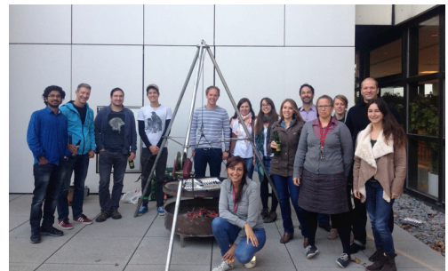
Get-Together BBQ end of September