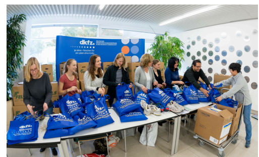
Bag collection in the main building

The “DKFZ Asylkreis” is thinking about further campaigns to continuously assist the refugees in Heidelberg. If you are interested in joining, simply write an email to c.laufer@dkfz.de