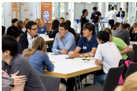
Career Day R&D session and round table discussions

Here are some take home messages from the career day: