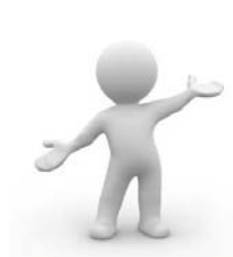
Could be you... Your interests