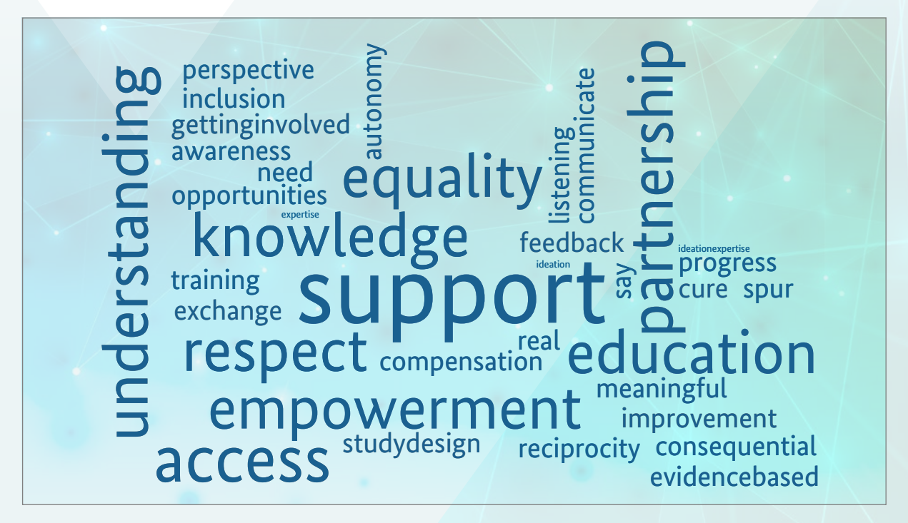
Figure 2: Word cloud of 45 phrases collected by participants in session 1 "Vision" of the online workshop in December (in response to the question: "Which catch words would you choose to describe your personal vision or ambition regarding active patient involvement in cancer research?")

The following chapters, 1) A Shared Vision, 2) Strategy, Level and Timing of Involvement, 3) Communication, Understanding and Relationships, 4) Resources, Knowledge and Skills, 5) Methods and Approaches, and 6) Ethical and Legal Aspects, present the collated principles in detail, as derived from discussions in the workshop series during the bottom-up process.