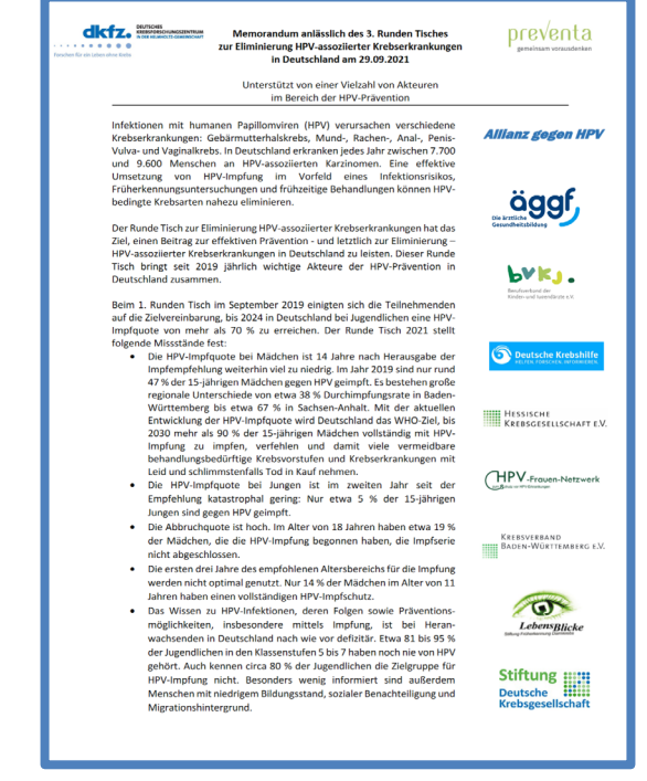
Figure 3: Memorandum from the 3rd Roundtable