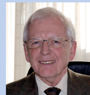
Professor Harald zur Hausen is the winner of the 2008 Nobel Prize for Medicine for discovering human papillomaviruses that cause cervical cancer. Former Scientific Director, Deutsches Krebsforschungszentrum (DKFZ; German Cancer Research Center) from 1983 to 2003